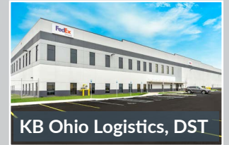
KB Ohio Logistics, DST

Property Type: Medical Location: Temecula, CA Annual Cash Flow: 6.00%