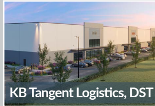
KB Tangent Logistics, DST

Property Type: Industrial Location: Tangent, OR Annual Cash Flow: 5.85%