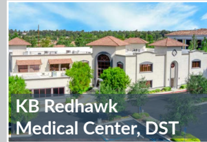
KB Redhawk Medical Center, DST

Property Type: Industrial Location: Tangent, OR Annual Cash Flow: 5.85%