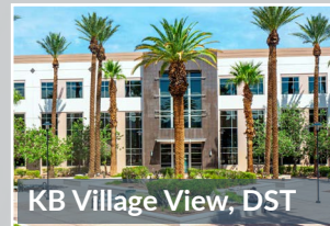
KB Village View, DST

Property Type: Office Location: Laguna Hills, CA Annual Cash Flow: 5.00%